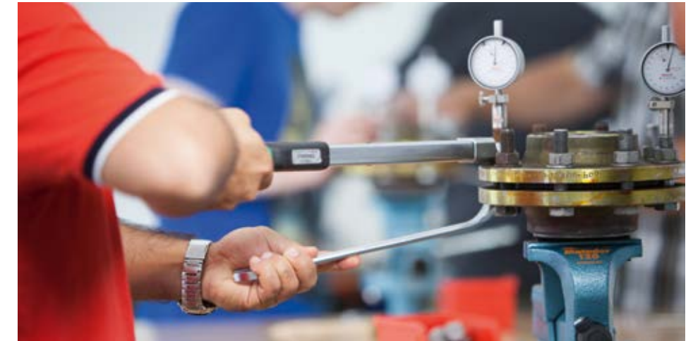
Applying the correct torque is imperative for plant safety