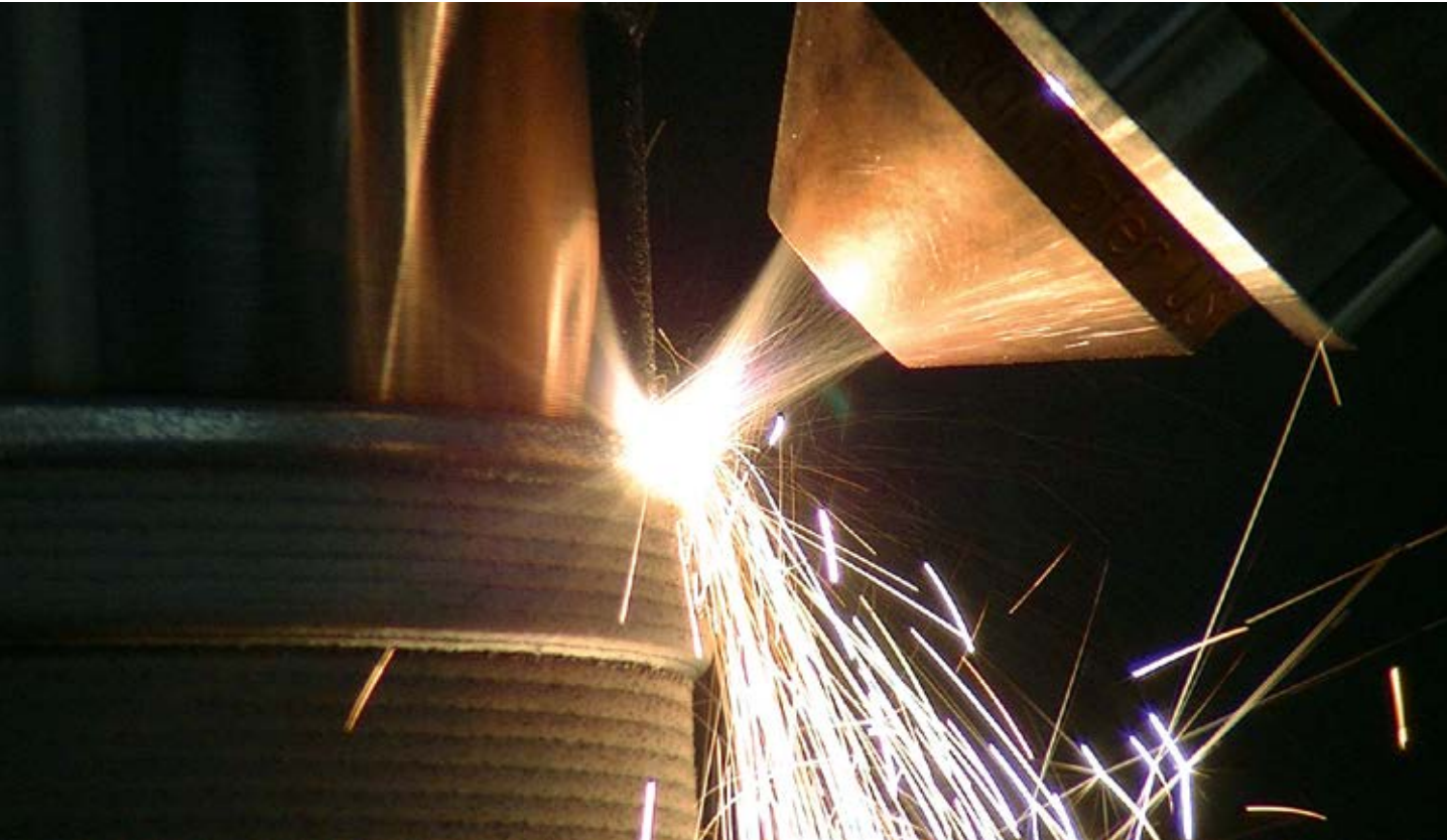
Westad makes use of powerful beam welding technology

Conservative industries are generally characterized by very precise product requirements and very little or no room for either improvement or innovation. While this may be true, it has certainly not kept Westad from seeking more efficient and cost-effective ways to provide the services its customers demand. The latest innovation: Following an investment of slightly less than 1 million euros, Westad now relies on powerful laser beam welding technology in its manufacturing processes.