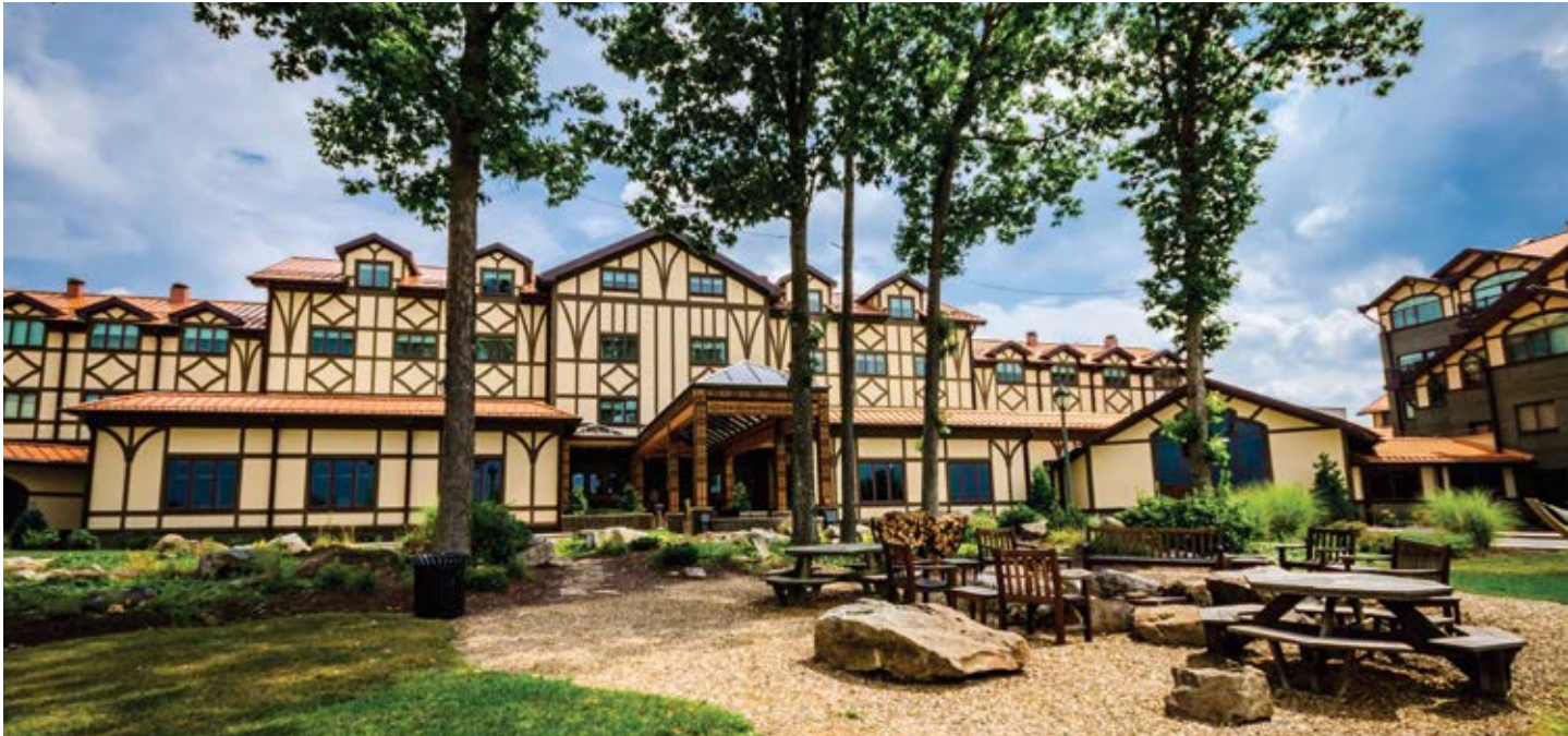
This year's DRP Council Meeting was held in the mountains of Southwestern Pennsylvania

Thermoseal holds annual DRP Council Conference