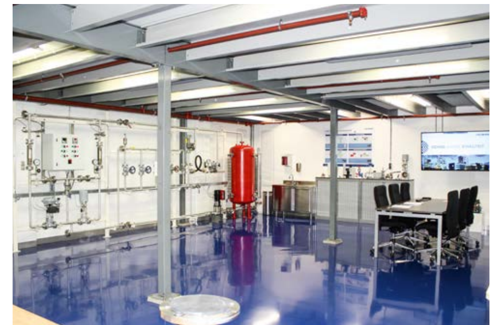
Left: Fully operational demonstration setup. Right: Meeting space with multimedia capabilities

components. Additionally, KLINGER product specialists can provide detailed information on the performance characteristics of valves in a production environment and help with the optimal selection of products. This in turn may reduce clients' expenses by keeping maintenance costs down and improving the integrity and durability of the systems. Essentially, Practicum is a personalized and interactive