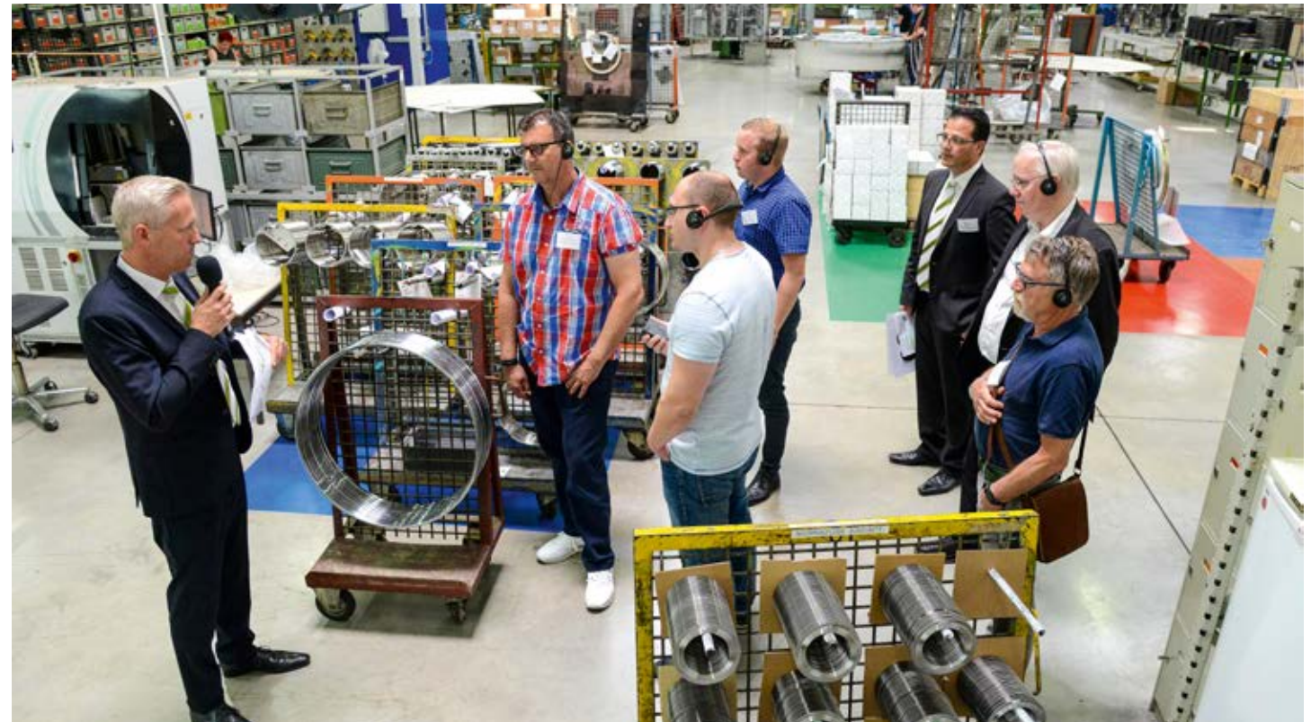
The attendees also had the opportunity to tour Kempchen's production facilities