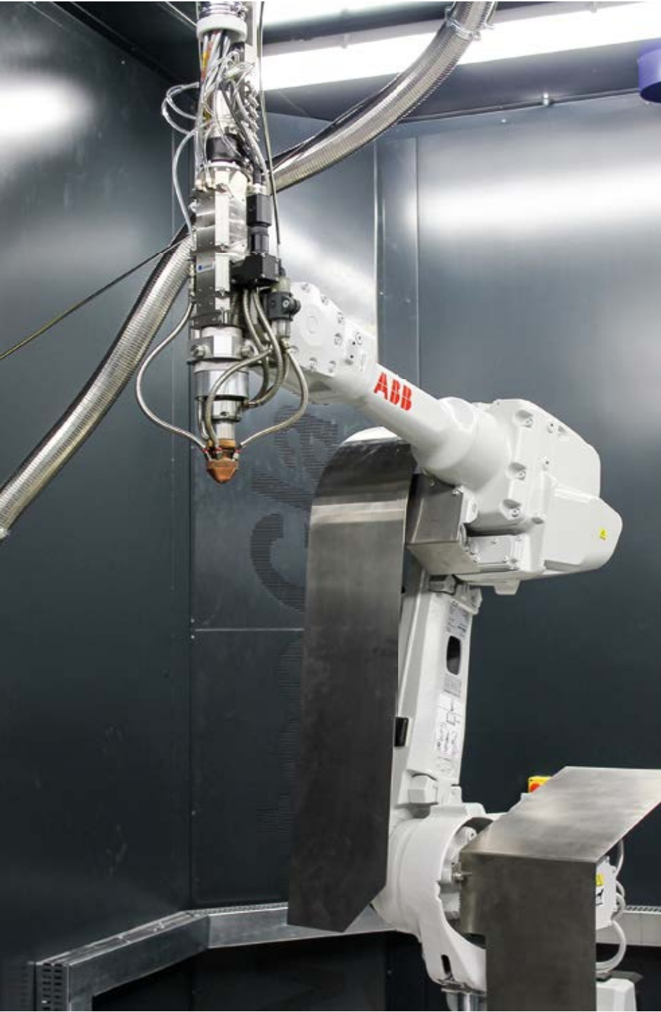
The 6-axis welding robot manages even the most complex tasks

"We are continuously adapting the laser welding technology to meet the very specific requirements of the marine industry," confirms Jørn-Inge, adding: "For example, we have recently partnered up with another company to create a new type of butterfly valve that will require laser welding. Furthermore, we are also looking at