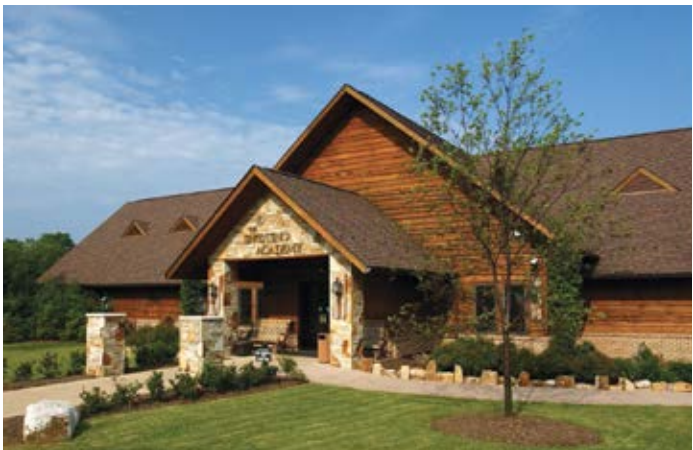
The Field Club's Shooting Academy