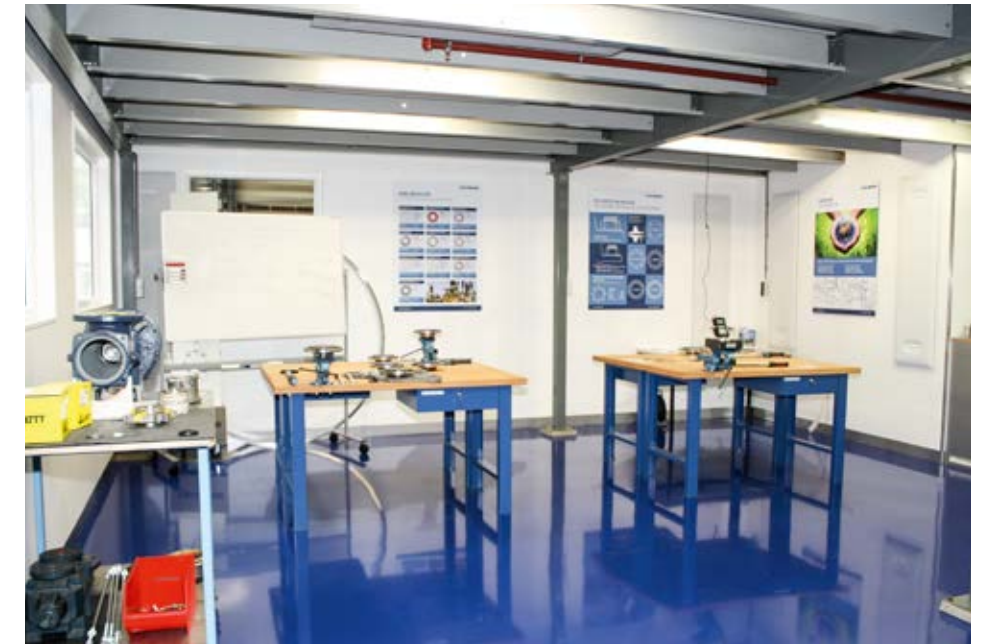
Worktables for flange management and assembly training include, amongst others, a torque wrench calibration station and practice flanges

The Practicum setup is versatile and educational, but ultimately it has to benefit existing and potential customers, which it does in a number of ways. It showcases the wide range of applications for individual products, as well as the quality of said