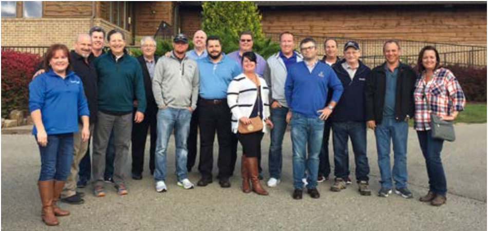
Thermoseal and the DRP members