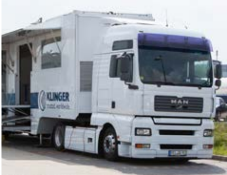
The KLINGER on Tour Truck

Having technicians attend advanced courses critical to their work is without doubt a necessity in order to ensure that all safety, efficiency and operational excellence requirements can be met at all times. Being able to spare colleagues, who are de facto