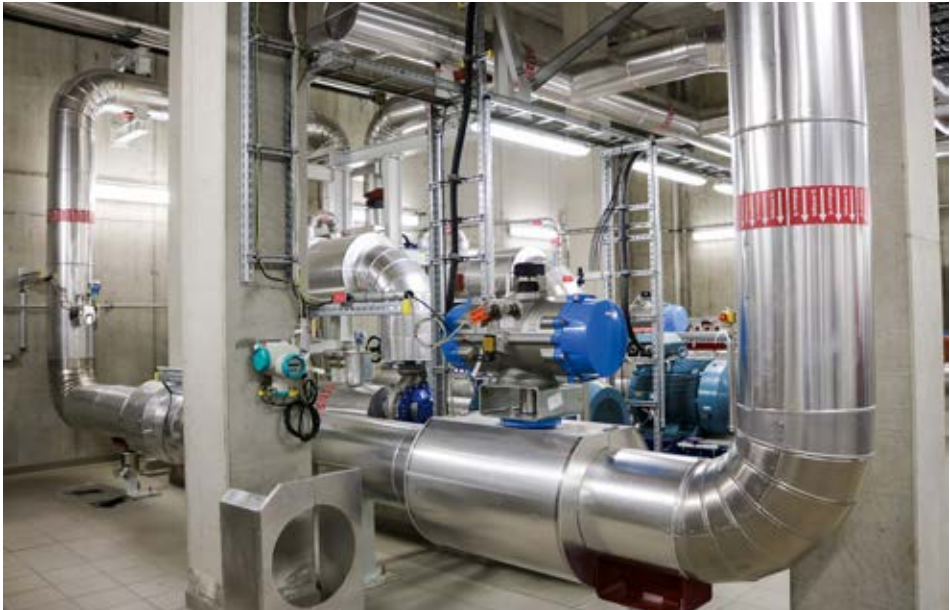
"Fernwärme Wien" is in charge of Vienna's district heating network

Erected in 1971, the waste incineration plant has been repeatedly modernized over the years to incorporate technological developments in the field of flue gas cleaning. It is interesting to note that the artistically rendered facade, which has in the meantime turned into one of Vienna's many landmarks, was actually not part of the original design: Following a major fire at the plant in the year 1987, Vienna's utility commissioned Fried-ensreich Hundertwasser to give the facility its "new look", which, according to the artist, combines technology, ecology and the arts. Today, the waste incineration plant burns around 260,000 tons of waste per year and can thus feed an annual average of 60 MW of heat into the district heating network for base load coverage purposes. Vienna's functional work of art is also used to help manage peak loads: Five additional gas and gas/oil-fueled high-temperature boilers can produce up to 400 MW of thermal power; the installed electrical capacity amounts to 6 MW. In total, the plant generates an annual amount of 40,000 MWh of electricity and 470,000 MWh of heat – more than 60,000 households in Vienna are provided for in this manner.