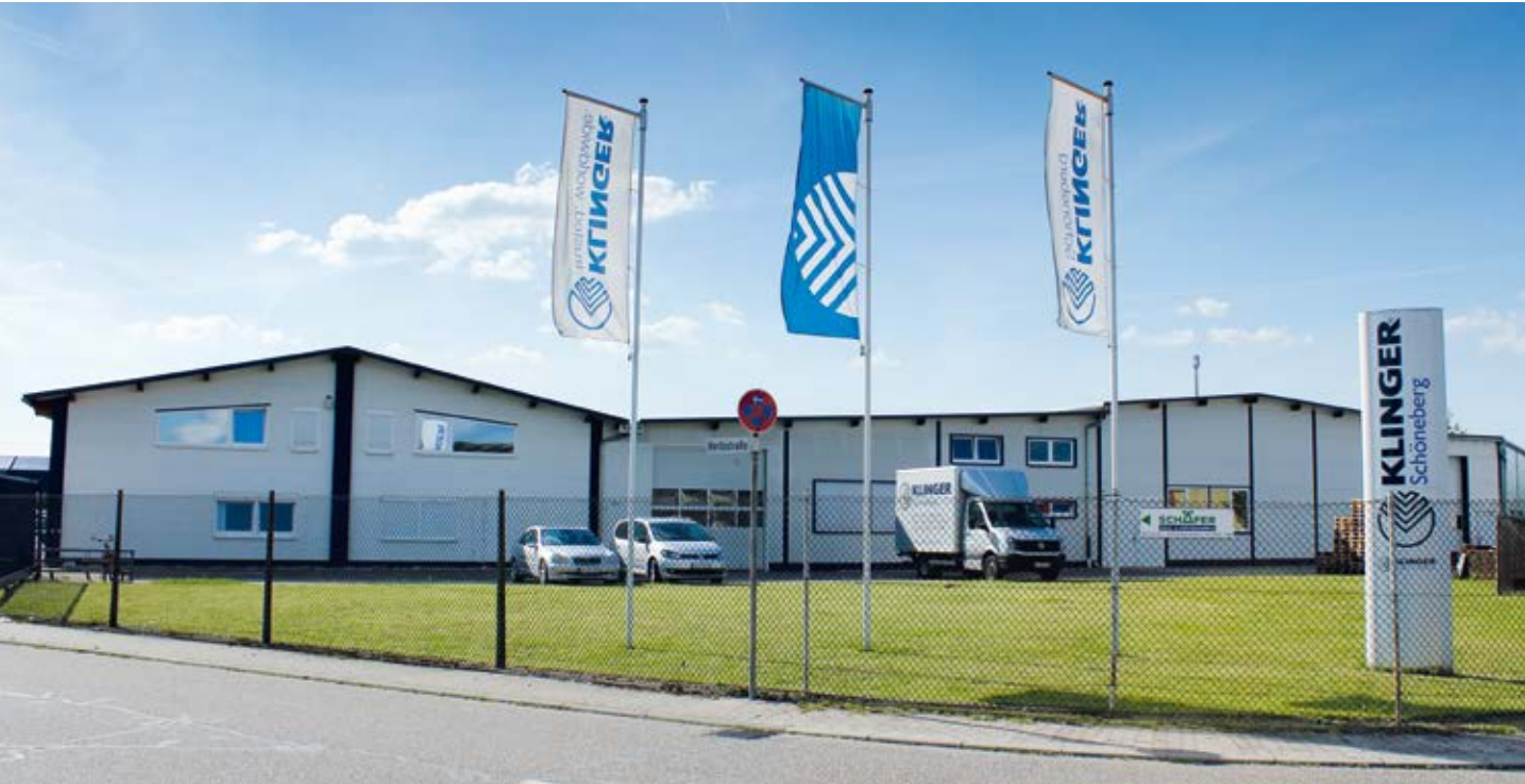
The valve specialist KLINGER Schöneberg in Graben-Neudorf (near Frankfurt, Germany)