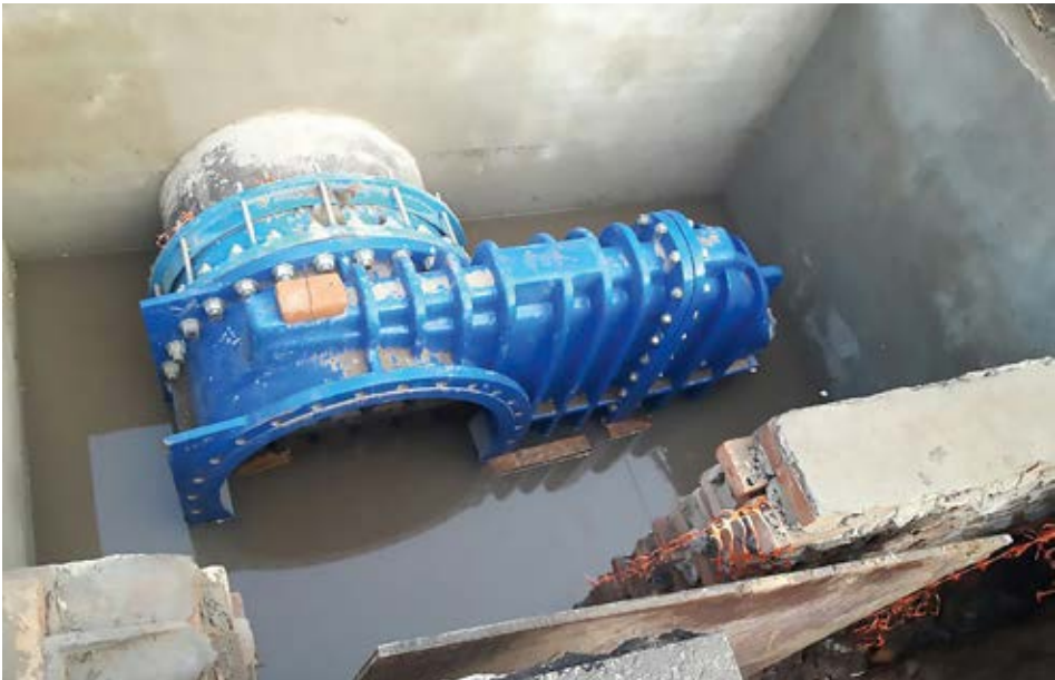
One of the faulty gate valves that caused an emergency in the province of Santa Fe

Industry, Water & Sewage Division, clearly recalls the emergency: "Aguas Santafesinas informed me that two of their gate valves in the province – a ductile iron DN 1000 and a DN 600 valve – could no longer be fully closed and regulating the flow of water was therefore no longer possible. According to the customer, the loss of water had reached the several-liters-range and the supply of potable water to the province via the