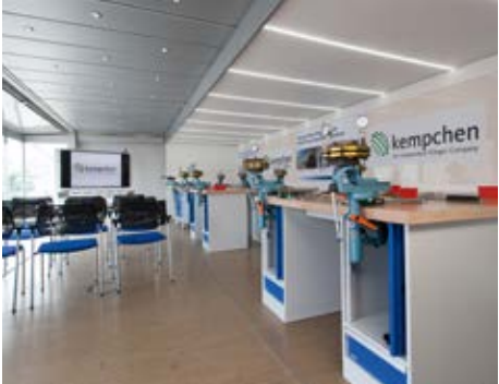
Inside KLINGER's mobile classroom

The major advantage of the "KLINGER on Tour Truck", which comes equipped with state of the art training workplaces, is that it can be deployed to virtually any business location of a customer. Everything that the to be trained employees need