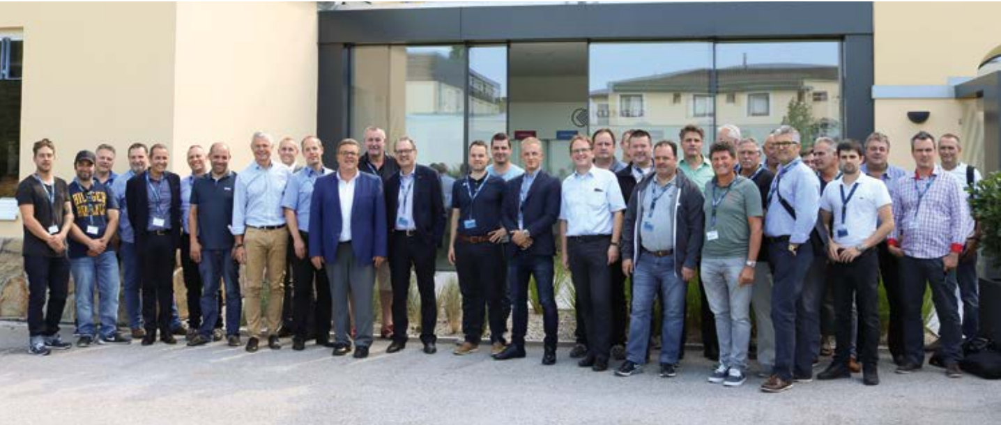
The Swiss delegation visits the KLINGER Holding

FRANZ GYSI AG and KLINGER host 13 th Swiss District Heating Conference