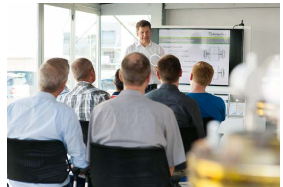
Kempchen Dichtungstechnik trained a total of 601 employees of Wacker Chemie AG