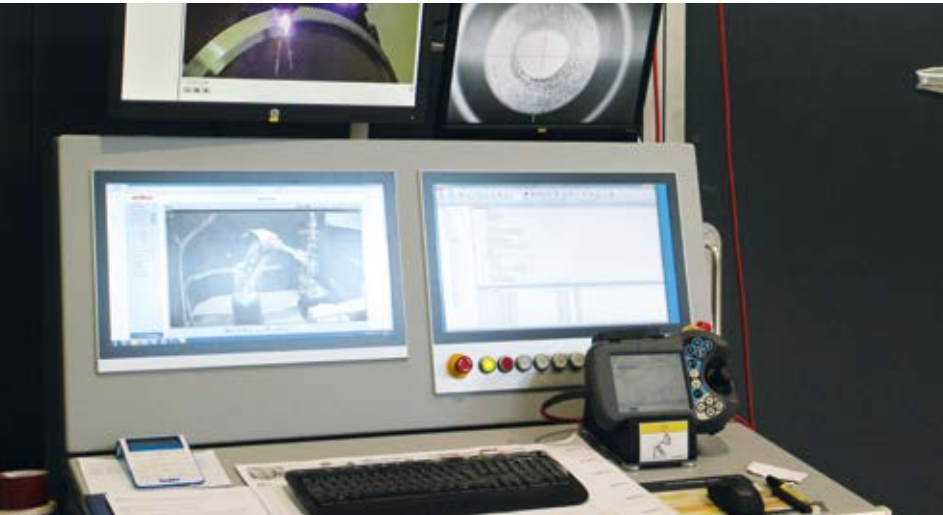
The control unit of Westad's new welding cell

After identifying, discussing and subsequently dismissing several proposals, the Norwegian colleagues finally "struck